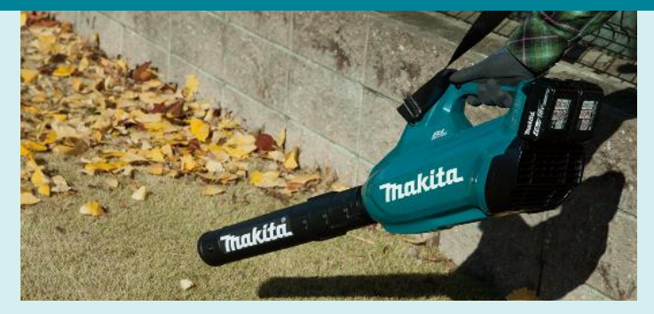
Max. air volume: 13.4 m<sup>3</sup>/min Max. air speed: 194.4 km/h