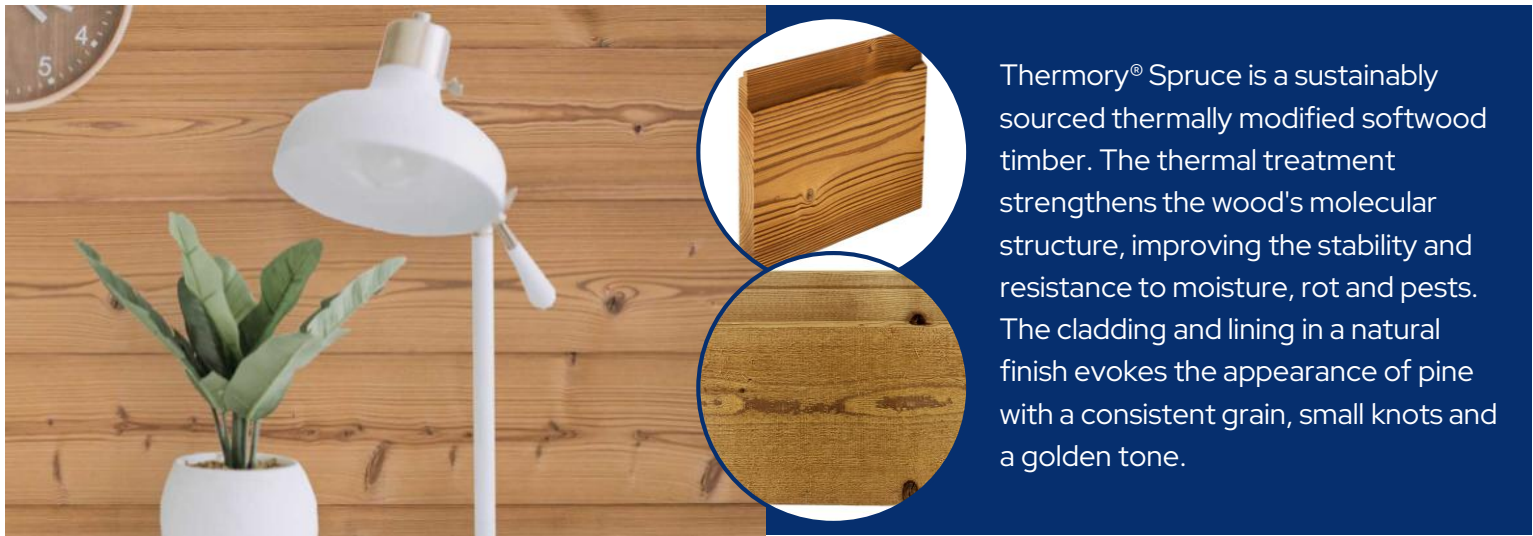
Main Image: Smooth Face finish. Top Inset Image: Brushed. Bottom Inset Image: Fine Sawn detail.