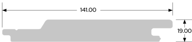
■ C26: 141 x 19 / cover: 125mm