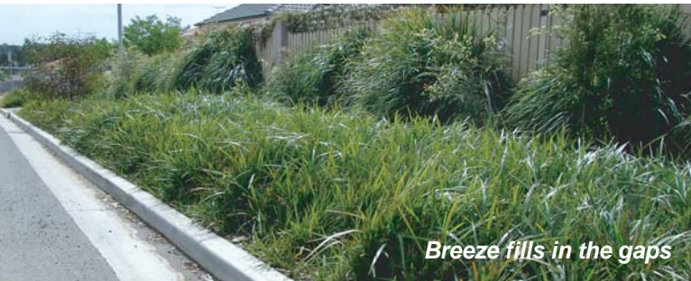
Breeze fills in the gaps

Breeze is able to cope with hot humidity, heat and drought in the summer. It is better in the cold than most other Dianella caerulea s. After the first trim, it is very low maintenance - trim approximately once every 4 to 6 years on average. Its underground rhizomes spread well, filling the gaps and outcompeting weeds. Breeze has excellent erosion control statistics. (See Specification sheets for your region.