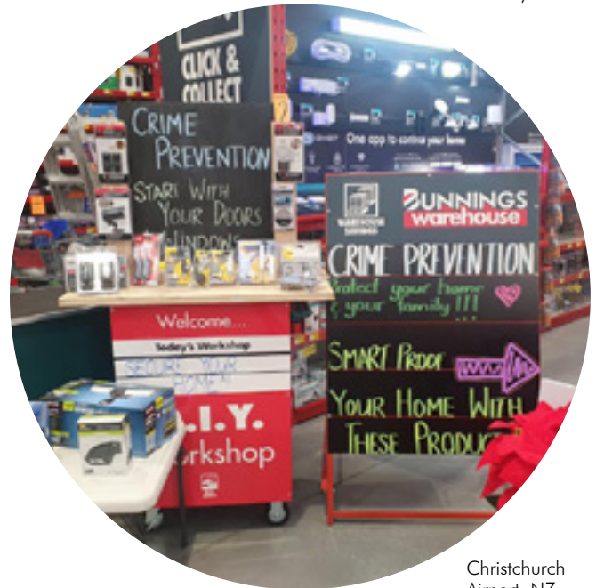
Christchurch Airport, NZ

We're proud to acknowledge the serving members of our police forces and their families, so that they can continue to carry out their important and outstanding work in keeping our communities safe. This builds on our long history of supporting police charities and clubs every year through our community sausage sizzles, collaboration on Crime Prevention Week, and advocating for safer communities by supporting programs like 'Safe Plates' to reduce car registration plate theft.