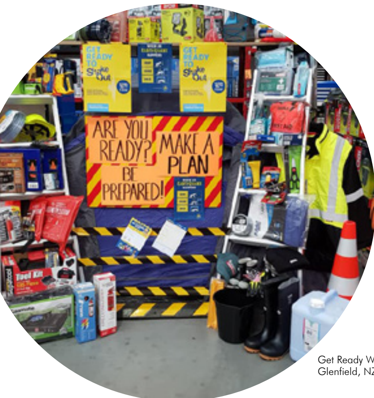
Get Ready Week, Glenfield, NZ