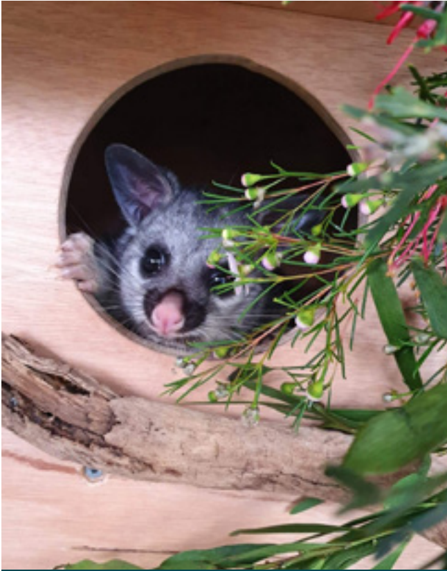
Animal Rescue Cooperative, WA