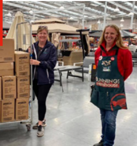
Port Macquarie, NSW

In June 2021, wild storms left more than 1,700 homes in the Dandenong Ranges, Victoria, without power, with long delays to have electricity returned. Bunnings donated 100 generators and safety equipment to the Victorian Government to distribute to those most in need, along with a further 20 generators to local community groups to provide further direct assistance. Extreme weather also saw flooding throughout parts of Gippsland, Victoria with Bunnings donating $20,000 to Rural Aid, enabling them to provide financial support to those impacted.