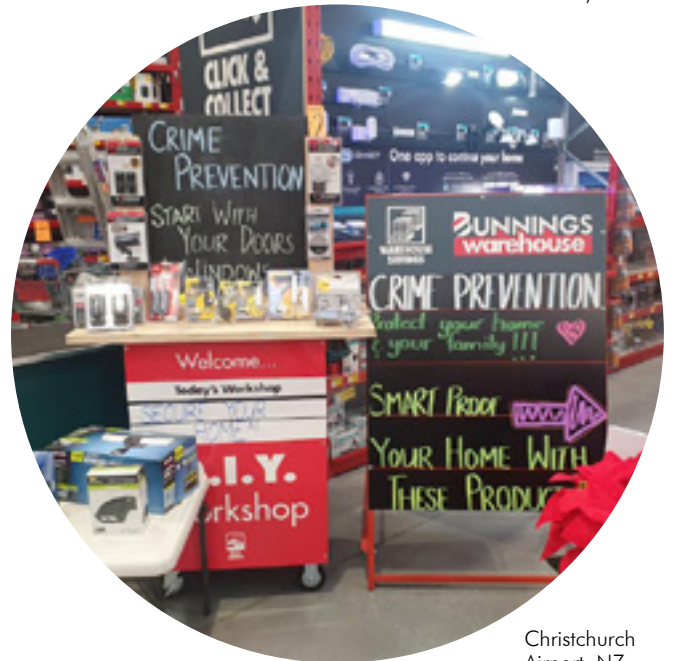
Christchurch Airport, NZ

We're proud to acknowledge the serving members of our police forces and their families, so that they can continue to carry out their important and outstanding work in keeping our communities safe. This builds on our long history of supporting police charities and clubs every year through our community sausage sizzles, collaboration on Crime Prevention Week, and advocating for safer communities by supporting programs like 'Safe Plates' to reduce car registration plate theft.