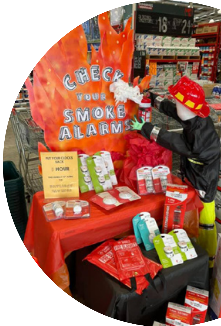
Smoke Alarm Campaign, North Shore, NZ

In Aotearoa/New Zealand, Bunnings helped raise awareness on emergency preparedness as part of the annual Get Ready Week, in conjunction with the Ministry of Civil Defence & Emergency Management. The aim of the initiative is to ensure the community can be prepared before, during and after emergencies such as earthquakes, floods, tsunamis and volcanic activity. Bunnings stores also participated in the Aotearoa/New Zealand Shakeout, the national earthquake drill and tsunami hīkoi to remind the community of safe actions to be taken in the event of an earthquake. Fire and Emergency New Zealand's Check Your Smoke Alarm campaign was also supported, with stores sharing information on smoke alarm maintenance and fire safety in the home.