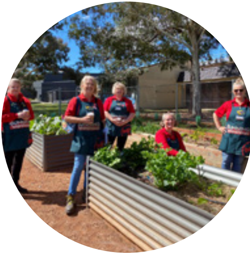
Canberra Airport, ACT