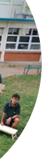
TV ad – Takanini, NZ Click on image to play video