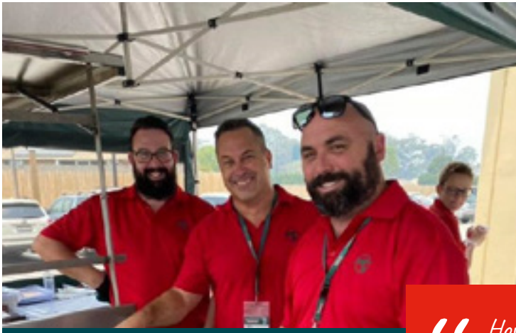
Port Macquarie, NSW

“ How grateful, relieved, and happy for the help we have received From GIVIT and Bunnings. Times are tough and it has taken a huge weight off our shoulders, as we were in no way financially able to meet the costs. Thank you to all who were involved, we will never forget the kindness.”