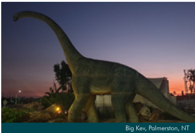
Big Kev, Palmerston, NT