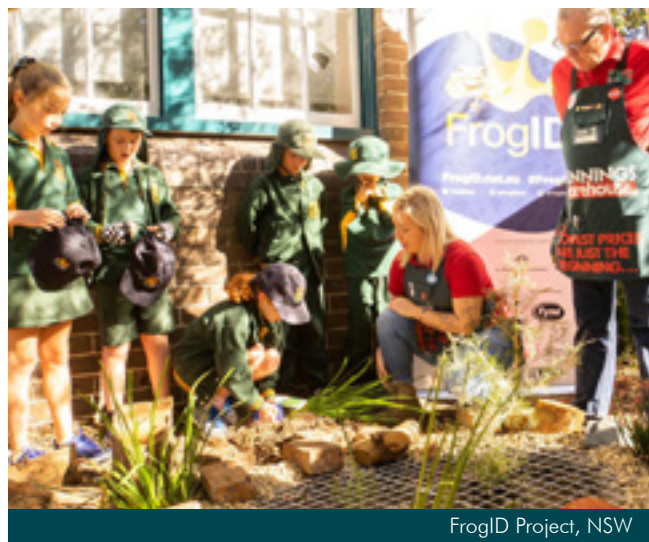
FrogID Project, NSW

of waste paint and packaging was collected through Paintback events during the year