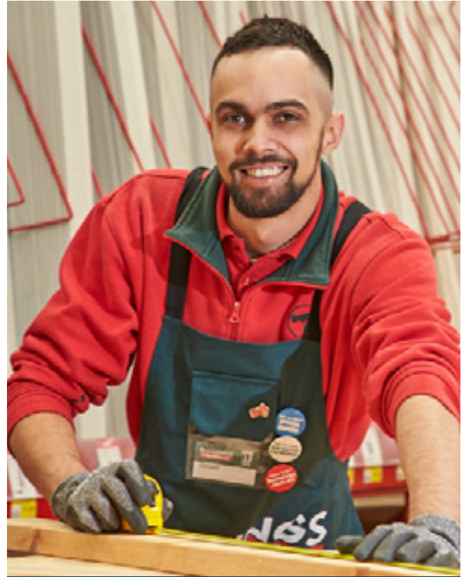
Bibra Lakes, WA