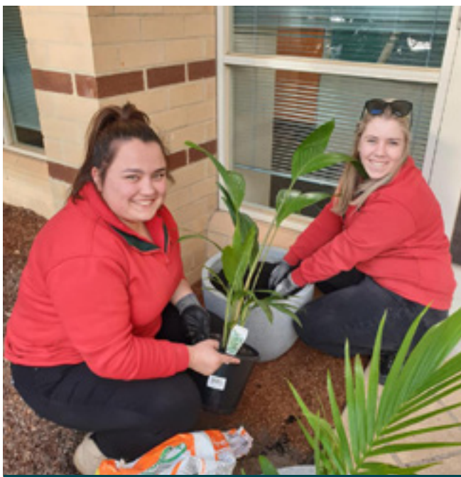
Carrum Downs, VIC