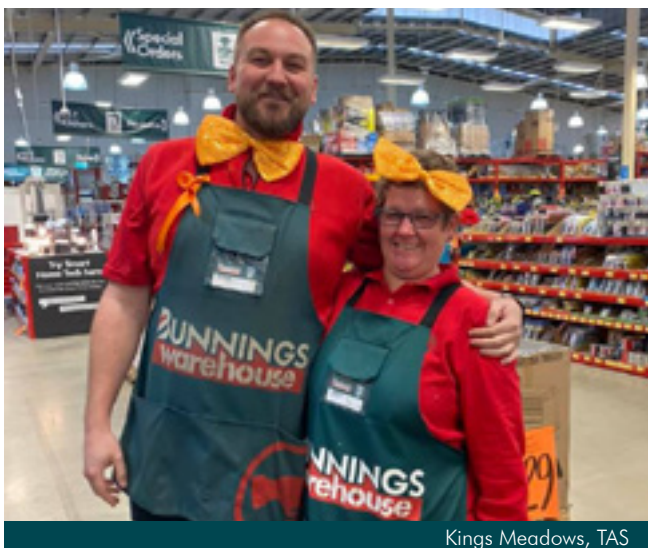
Kings Meadows, TAS