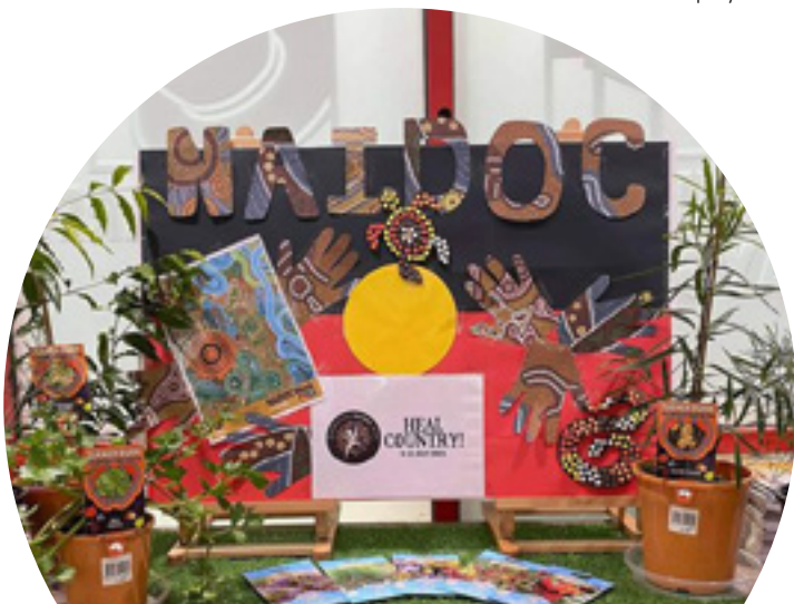
Naidoc Week display

We are so grateful for our team members who are passionate about the everyday use of te reo, and we'll continue to celebrate what te reo Māori represents to our teams and to Aotearoa/New Zealand history.