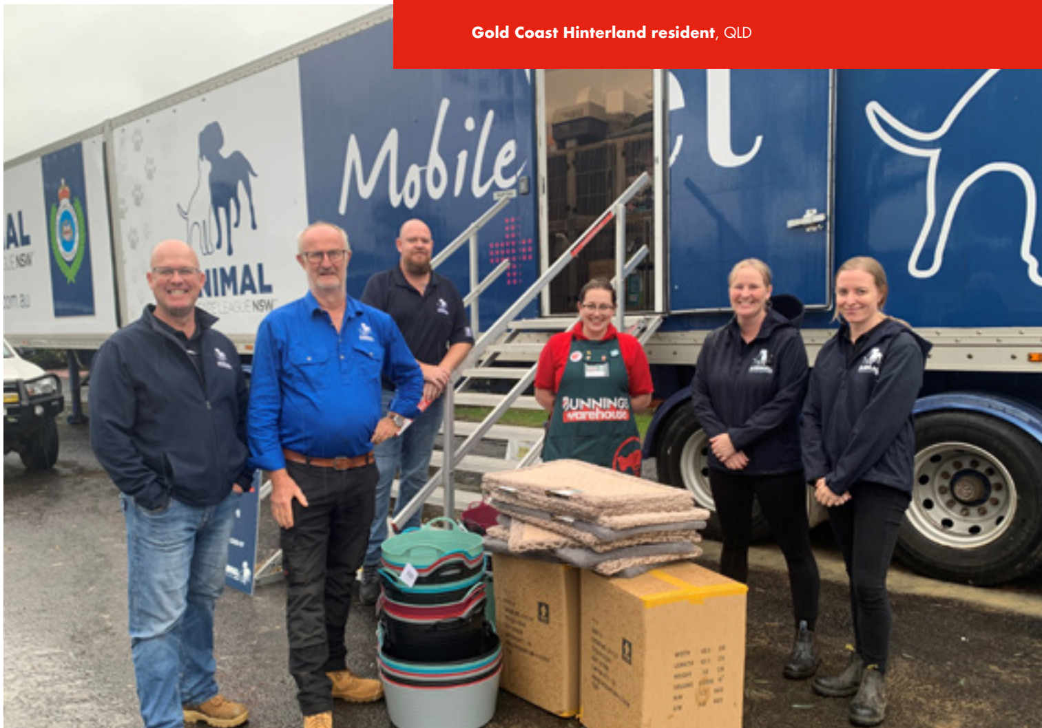
Flood Relief, Castle Hill, NSW