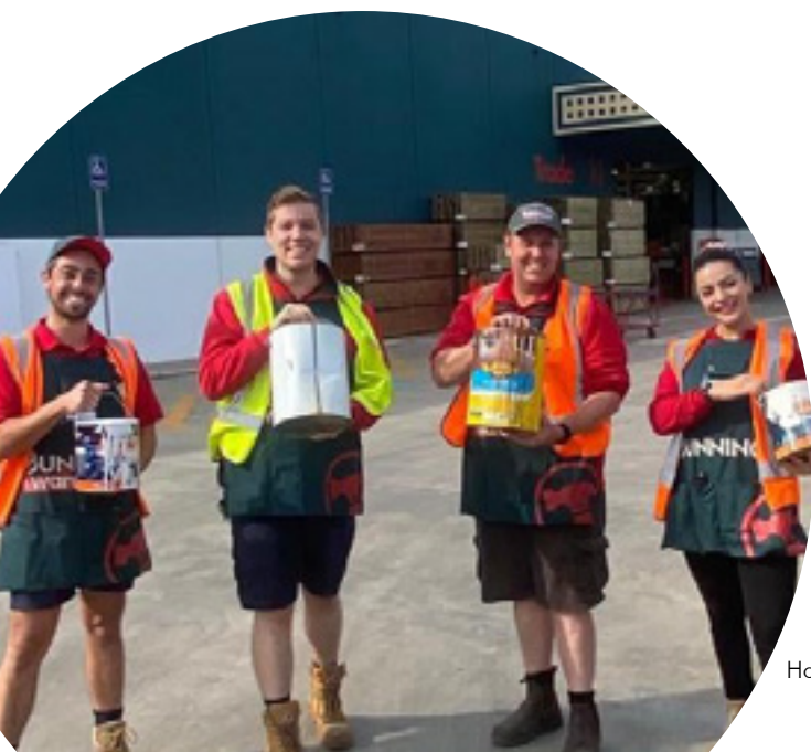
Hoppers Crossing, VIC

Our team also provided online resources for schools, including a video on how to maintain a frog pond and ensure a frog friendly habitat.