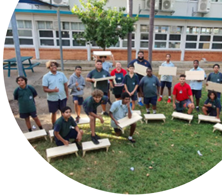
Fairfield Waters, QLD

As part of our commitment to improving the lives of young Aboriginal and Torres Strait Islander people, in Australia we are privileged to have a long-standing relationship with the Clontarf Foundation. Clontarf works to improve the education, life skills, self-esteem and employment prospects of young Aboriginal and Torres Strait Islander men. Through their academies, we invite Aboriginal and Torres Strait Islander secondary students to visit our stores, where our leaders share advice on preparing resumes, tips on the recruitment process and interview skills, and pathways to employment. We also encourage students to consider careers in retail or take part in work trials.