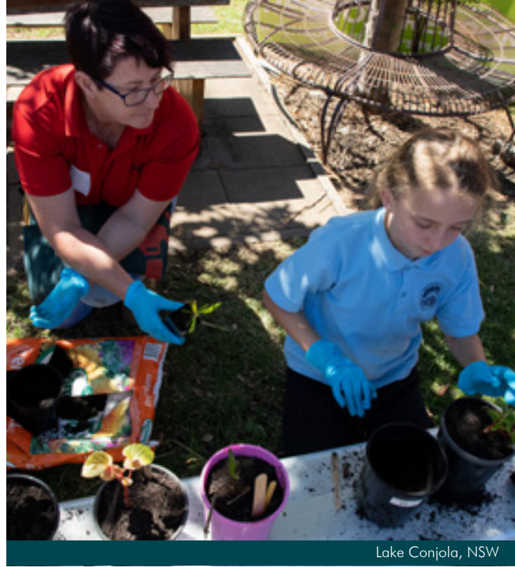
Lake Conjola, NSW

Our team continued to support the many communities recovering from the 2019/2020 Black Summer bushfires. This included hands-on support and a donation of products to the Convoy of Hope Regrow Response Program, aimed at regenerating the local area of Lake Conjola, New South Wales. Our local stores in Batemans Bay and Ulladulla donated plants, with team members educating school students on growing and nurturing the plants, which were then gifted to residents whose homes and gardens had been impacted by the bushfires.