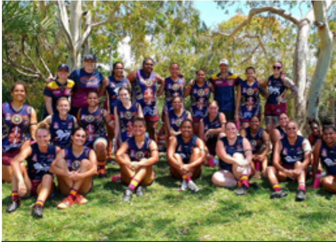
Cairns City Lions, QLD