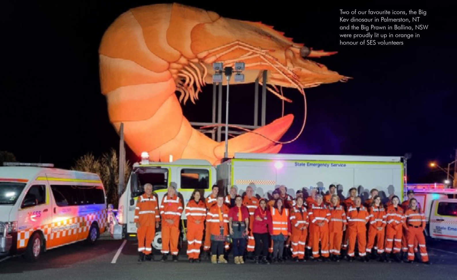
Big Prawn, Ballina, NSW

Two of our favourite icons, the Big Kev dinosaur in Palmerston, NT and the Big Prawn in Ballina, NSW were proudly lit up in orange in honour of SES volunteers