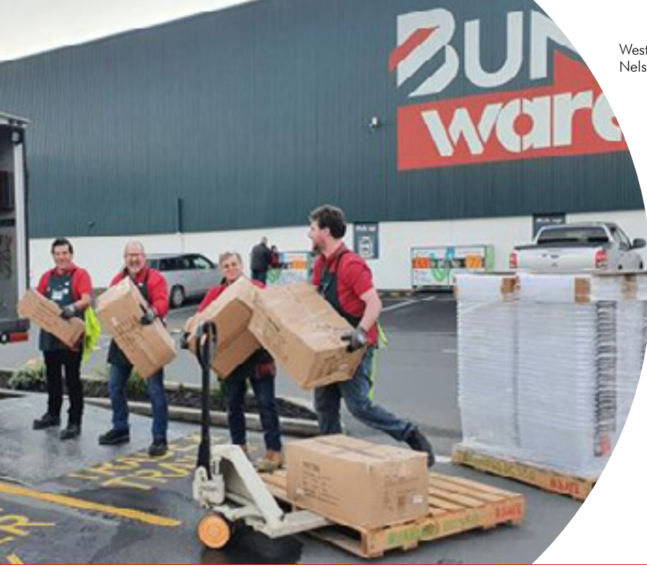
Westport Flood Relief, Nelson, NZ