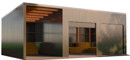
Lean-To Selected Enclosed

Roof & cladding materials may vary based on site location.