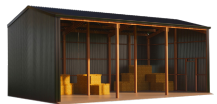
Gable Open Front