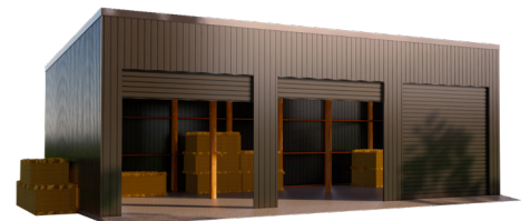
Lean-To Fully Enclosed