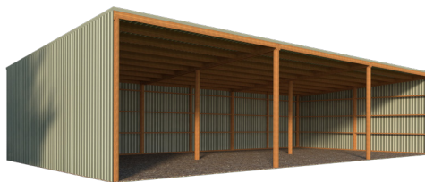
Lean-To Open Front