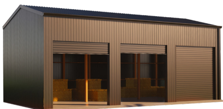
Gable Fully Enclosed