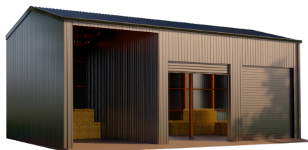
Gable Selected Enclosed