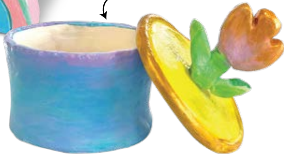
Trinket box with lid

Tip: Make sure the clay has fully dried before painting. A gloss or matt varnish can also be applied after the paint has dried to finish your project. Varnish sold separately.