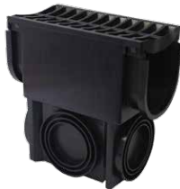
EasyDRAIN Slim Pit I/N | 4770218 EI Code | 83800