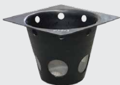
SQID® 300 to suit Series 300 Pit I/N | 0087466 EI Code | 97903

The SQID® range prevents gross pollutants from entering the stormwater system