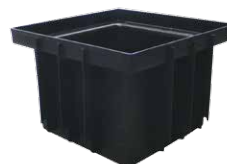
Series 450S Stormwater Pit* I/N | 110627 EI Code | 80034

* Available with Class A Galvanised Grate (84827) or Aluminium Grate (84845)