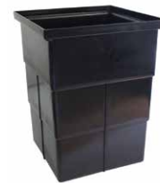
Series 300D Stormwater Pit* I/N | 4771445 EI Code | 84816