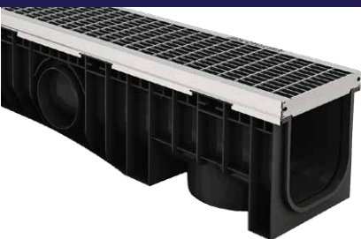
TechnoDRAIN Evomax 150H channel + Class B Galvanised Grate I/N | 4770235 EI Code | 81471