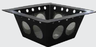
SQID® 450 to suit Series 450 Pit I/N | 0087467 EI Code | 97904