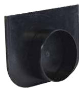
TechnoDRAIN Evomax 200H End Cap I/N | 4770239 EI Code | 81402