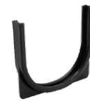
EasyDRAIN Converter I/N | 4770217 EI Code | 83370