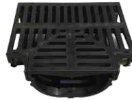
EasyDRAIN Compact Tee Piece I/N | 0087139 EI Code | 83550