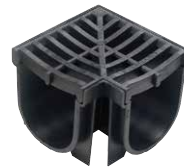
EasyDRAIN Corner I/N | 4770177 EI Code | 83330