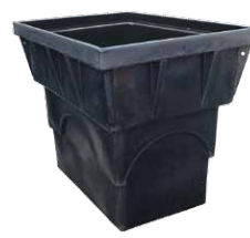
900 x 600 Stormwater Pit* I/N | 0087464 EI Code | 97967

* Available with Class B 900 x 900 (15146) and 900 x 600 (15145) Grates