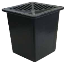
EasyDRAIN Rainwater Pit + Grate I/N | 4770245 + 4771607 EI Code | 84825 + 81010