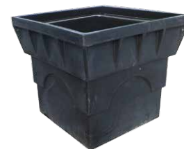
900 x 900 Stormwater Pit* I/N | 0087461 EI Code | 97965