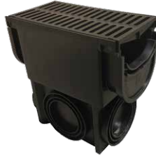
EasyDRAIN Compact Slim Pit I/N | 0087136 EI Code | 83540