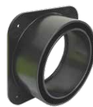
Pit Boss for Rainwater Pit I/N | 4770394 EI Code | 80080