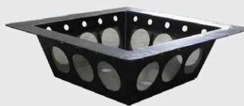
SQID® 600 to suit Series 600 Pit I/N | 0087468 EI Code | 97905