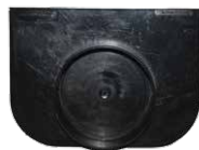
TechnoDRAIN Evomax 150H End Cap I/N | 4770238 EI Code | 81422