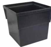
Series 300S Stormwater Pit* I/N | 4771398 EI Code | 84811