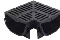
EasyDRAIN Compact Corner I/N | 4770220 EI Code | 83600