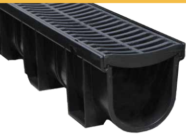
EasyDRAIN channel + Grate I/N | 47702061 | 4770175 EI Code | 1M 83300 | 3M 83390

Our EasyDRAIN™ system has a deep 100mm profile, making it ideal for high rainfall levels and water flow