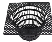
Leaf Basket for Rainwater Pit I/N | 4770227 EI Code | 84041