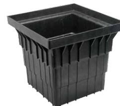
Series 450D Stormwater Pit* I/N | 4771372 EI Code | 80001