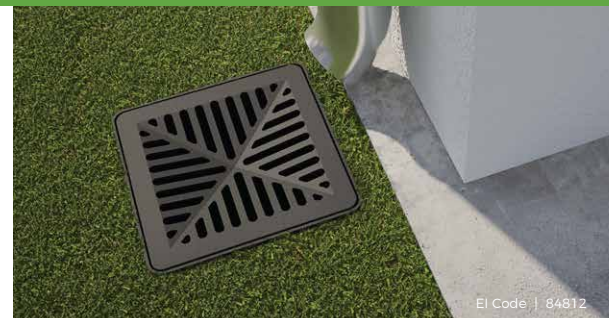
EI Code | 84812