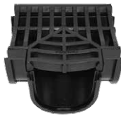
EasyDRAIN Tee Piece I/N | 4770214 EI Code | 83400