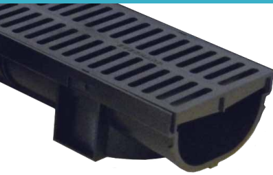
EasyDRAIN Compact channel + Grate I/N | 4770222 | 4770469 EI Code | 1M 83500 | 3M 83530

Our EasyDRAIN™ COMPACT system has a shallow 80mm profile, making it ideal for low rainfall and low water flow areas