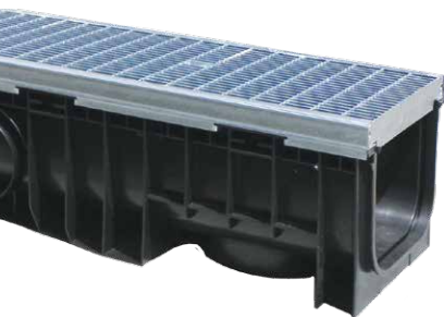
TechnoDRAIN Evomax 200H channel + Class B Galvanised Grate I/N | 4770236 EI Code | 81503