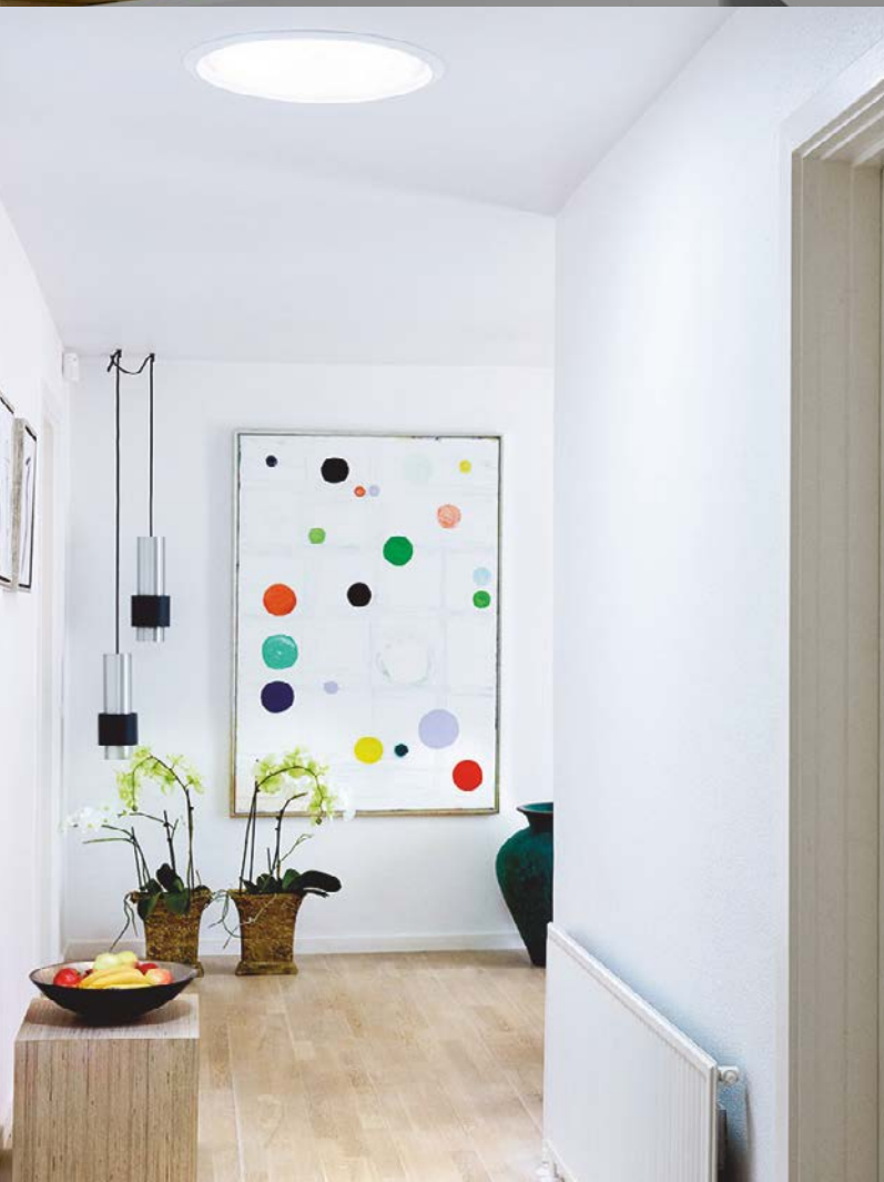
15°-60° INSTALLATION PITCH*