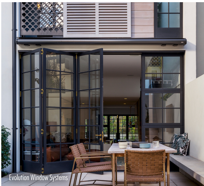
Evolution Window Systems

Versatile in design, glass doors complement various architectural styles with their sleek and modern appearance. Safety tempered glass also ensures durability and resistance to impact, giving you peace of mind without having to compromise on style.