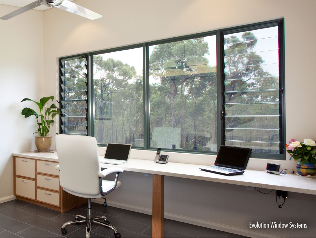
Evolution Window Systems