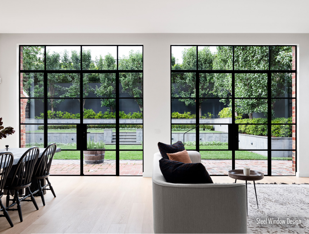
Steel Window Design