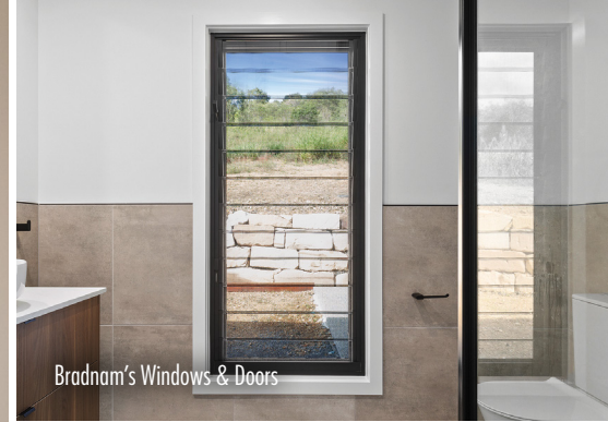
Bradnam's Windows & Doors