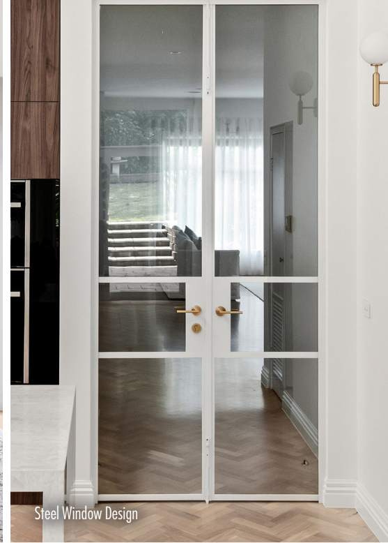
Steel Window Design