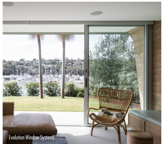
Evolution Window Systems