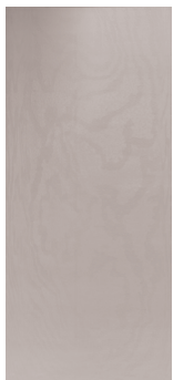
Flush FLWG or FLWM