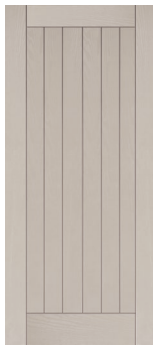
T&G FV2WG or FVWM