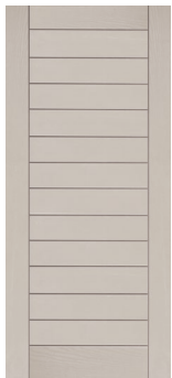
T&G Horizontal FGHTG