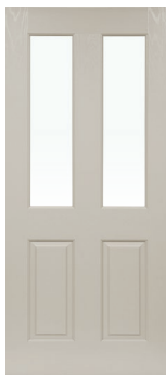
Hawthorn glazed F4 OT