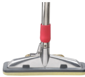
Grout & Tile Wand