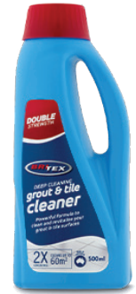
Grout & Tile Cleaner