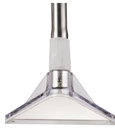
Carpet Wand Included in machine hire