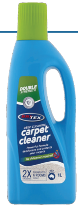
Carpet Cleaner 1L - 0293187

Covers approx. 60m 2 (3 average sized bedrooms)