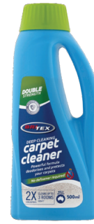
Carpet Cleaner 500mL - 0293185

Covers approx. 60m 2 (3 average sized bedrooms)