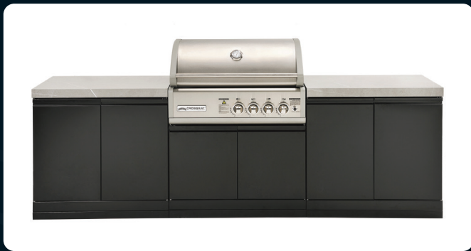
TC4K-05 Double side cabinets with flat benchtops I/N: 0293125