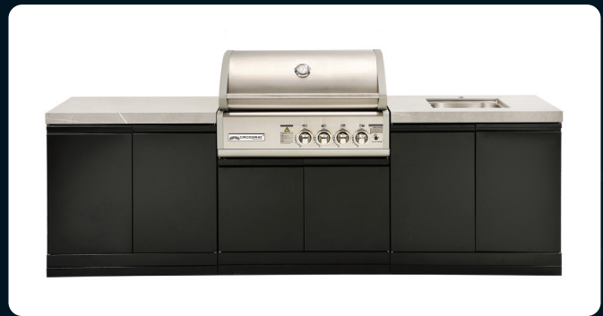
TC4K-06 Double side cabinets with 1 x flat benchtop & under bench sink I/N: 0293127