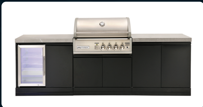
TC4K-07 Double side cabinets with flat benchtops & single fridge I/N: 0293128