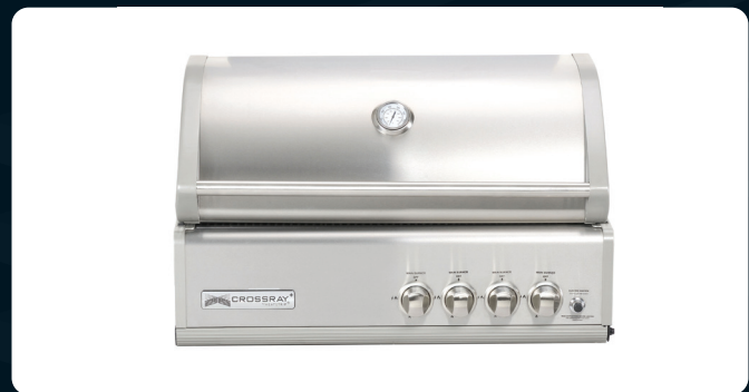
4 burner In-Built BBQ Model TCS4FL I/N: 0106530