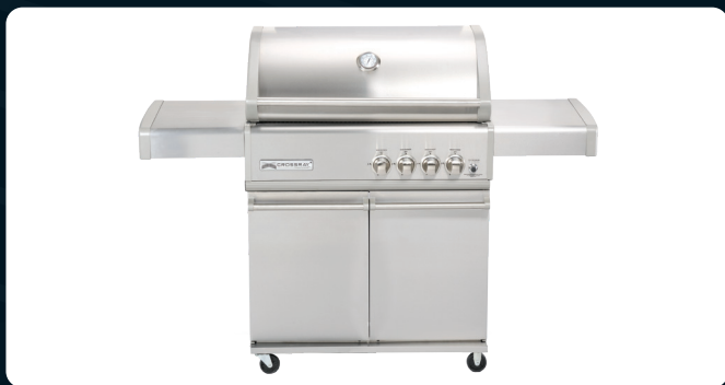
4 burner Trolley BBQ Model TCS4PL I/N: 0106531

The Range All CROSSRAY BBQ's come with grill plates as standard