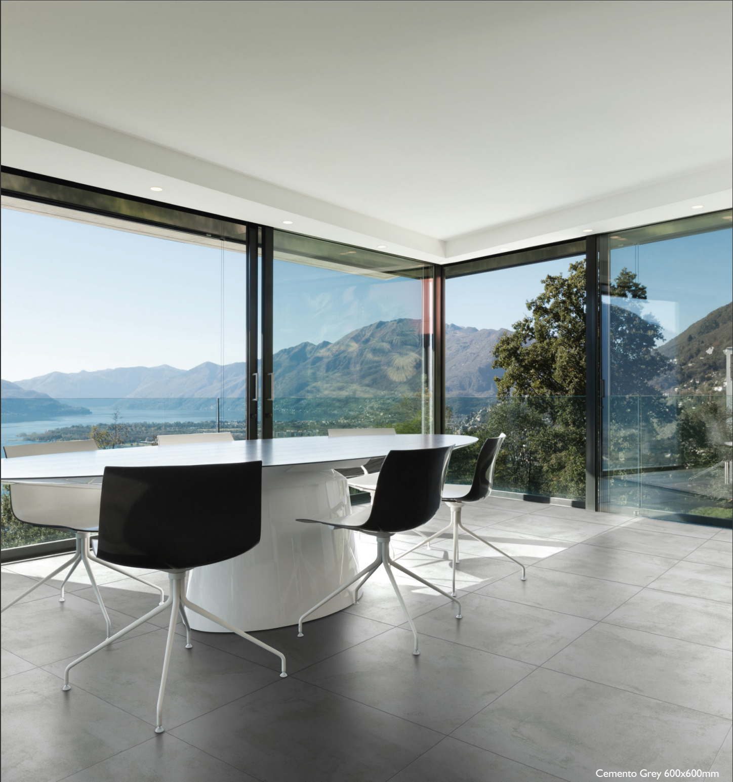
Cemento Grey 600x600mm