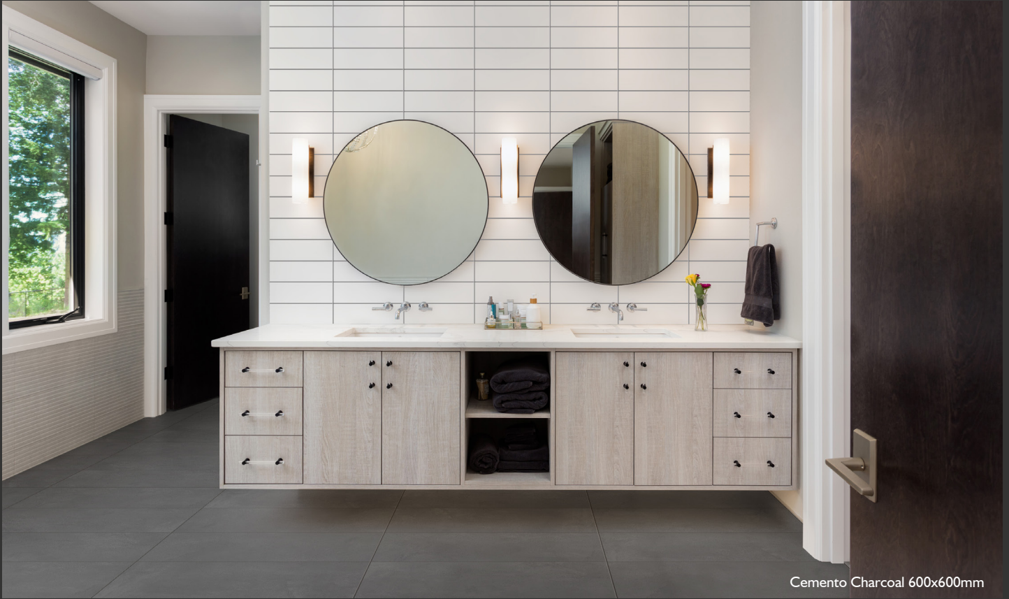
Cemento Charcoal 600x600mm