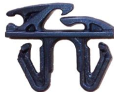
External Clip (for use on the very outside line only)