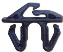
Internal Clip (for use on all 6 internal lines)