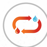
Hot water that never runs out