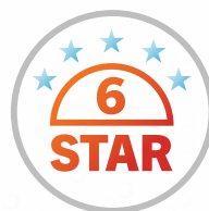
6 Star energy efficiency