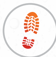
Small footprint saving space