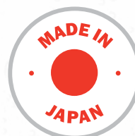
Made in Japan