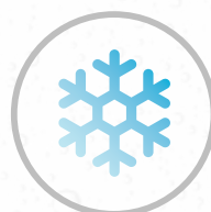
Frost protection system