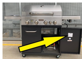
Location of data label